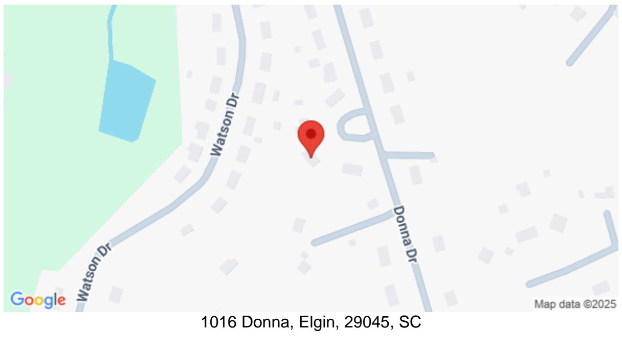
1016 Donna, Elgin, 29045, SC